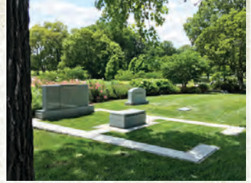
FAMILY ESTATES OF WILDWOOD VALLEY

The Family Estates of Wildwood Valley are located along the highest terrace of the gardens, adjacent to Bellefontaine's Lake Avenue. Each Family Estate can accommodate cremation, traditional, or green burial, and may range in size from 4 to 24 graves, with lot pricing beginning at $20,000. These estates back up to lush gardens, and feature sweeping views of Wildwood Valley and its surrounding lakes.