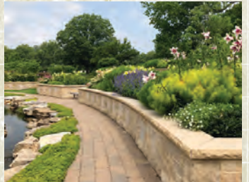
STREAMSIDE CREMATION GARDEN BURIALS AT WILDWOOD VALLEY

The Cremation Gardens at Wildwood Valley accommodate in-ground scattering and cremation burial in bio-degradable urns. Benches and a paved pathway line the area between each cremation garden and the stream. Each cremation burial is memorialized via a dedicated panel on the adjacent garden wall. Pricing for cremation burial begins at $4,000 for the first right of interment, and $1,200 for the second right.