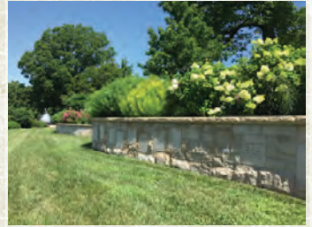
MEMORIAL WALL AND GARDEN LAWN CRYPTS OF WILDWOOD VALLEY

The Garden Lawn Crypts of Wildwood Valley are aligned just below the Family Estates in the grassy middle terrace of the gardens. Each lawn crypt is a pre-installed outer burial container accommodating up to two traditional burials in a single gravespace. For those who prefer an outer container such as a vault, these lawn crypts serve as an ideal alternative. Each garden lawn crypt includes two burial rights sold together, and memorialization on a dedicated panel in the adjacent garden wall. Pricing begins at $7,500 for two rights of interment.