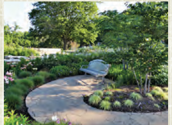
PRIVATE STATUARY GARDENS AT WILDWOOD VALLEY

The Private Statuary Gardens of Wildwood Valley are tucked throughout the lower terrace. These exclusive alcoves accommodate cremation burial and provide opportunities for custom statuary and other specialized memorialization. Each private garden is unique, but most offer views of the stream, semi-private walkways, and benches. A single garden may accommodate from 6-16+ cremations, with pricing beginning at $50,000.