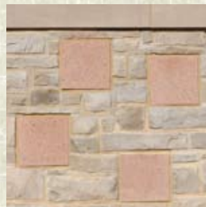
NICHES IN COLUMBARIUM