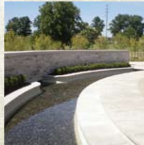
OUTER RING REFLECTING POOL