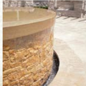
FOUNTAIN INSIDE COLUMBARIUM

For more information please call: 314-381-0750.